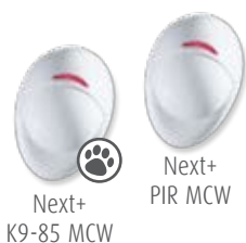
Next+ K9-85 MCW